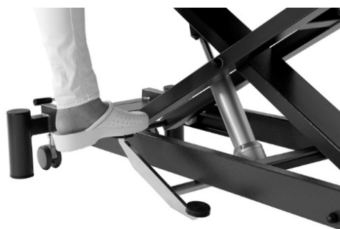
Giove 4 hydraulic