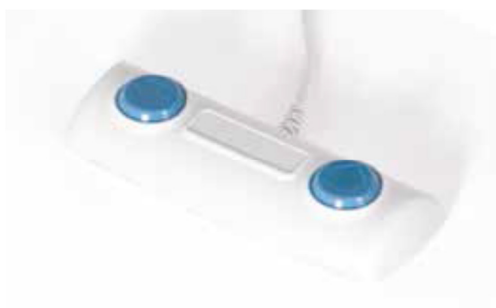
Giove 4 with 24V foot pedal