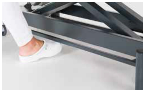
Giove 4 with all around foot bar switch